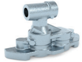
Cast final part